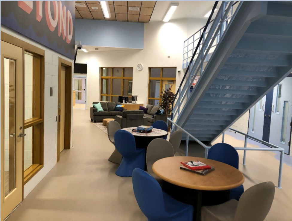
Photo Courtesy of King County's Children & Family Justice Center Merit Hall