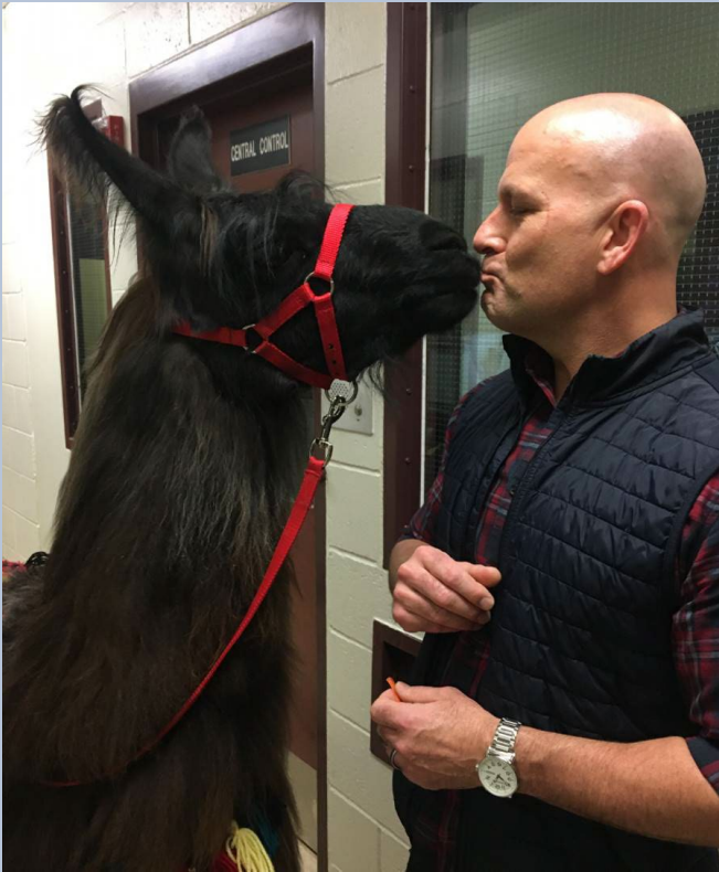
Photo courtesy of Clark County Juvenile Detention Emotional Support Animal Visits